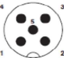
5-Pin M12 Connector